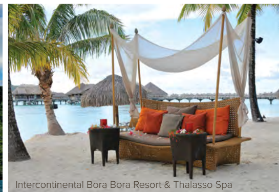
Intercontinental Bora Bora Resort &amp; Thalasso Spa