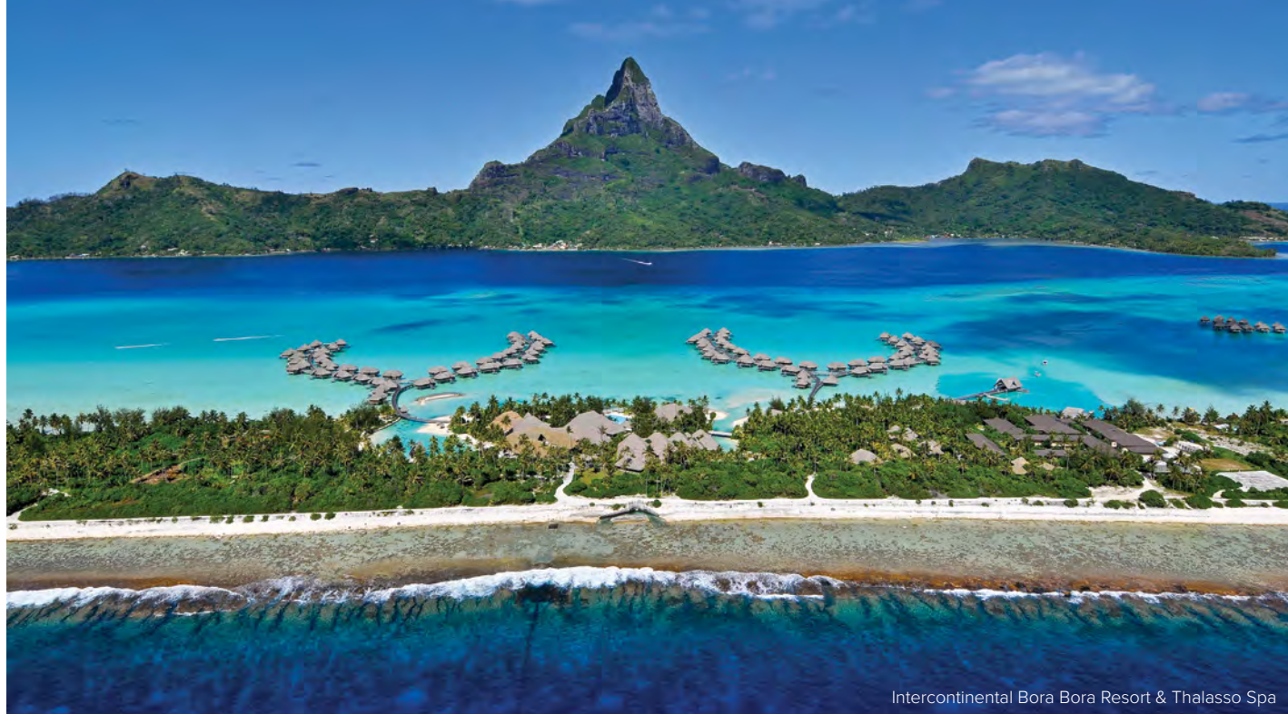
Intercontinental Bora Bora Resort &amp; Thalasso Spa