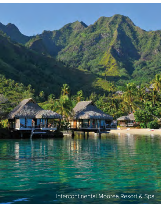
Intercontinental Moorea Resort &amp; Spa