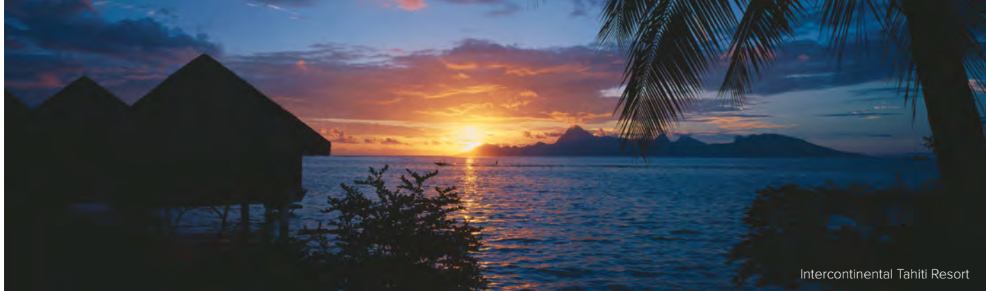
Intercontinental Tahiti Resort