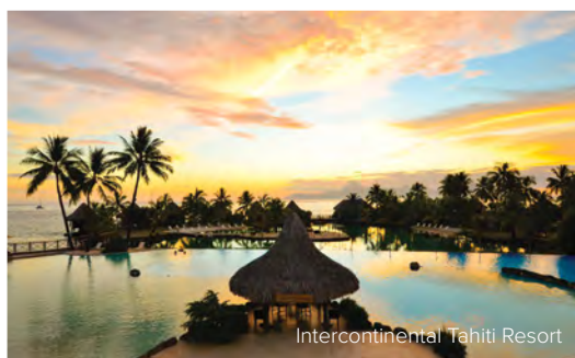
Intercontinental Tahiti Resort